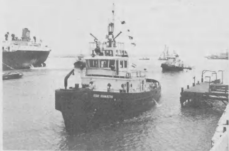
Oil Movement's newest asset is this new tug "Esso Oranjestad" which arrived here at the tug pier in San Nicolas Harbor May 2. It was welcomed by old tug "Esso Oranjestad", "Esso San Nicolas" and the Government tug "Arikok". E propiedad mas nobo di Oil Movements ta e tug nobo aki "Esso Oranjestad", cu a yega aki na e pier di tug den Haaf di San Nicolas Mei 2. El a ser duna bonbini pa tug bieuw "Esso Oranjestad", "Esso San Nicolas" y "Arikok".

Some highlights of the plan are: Relatively long period for loan repayment; minimum downpayment is 5%; low interest rate; payroll deduction for loan repayment, easier system of collateral; mortgage loan can be used to liquidate an existing high interest mortgage, and a number of building plans will be made (Continued on page 2)